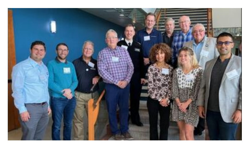
Pittsburgh AIHA Members at MASHA 2022

The Mid-Atlantic Safety and Health Alliance, Inc. (MASHA) is pleased to announce that their 14th annual Safety and Health Conference will be held on Thursday, October 26, 2023 at the Regional Learning Alliance Center (RLA) in Cranberry Township, PA. The Pittsburgh AIHA is a proud sponsor and exhibitor at this event.