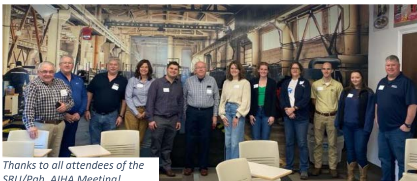
Thanks to all attendees of the SRU/Pgh. AIHA Meeting!